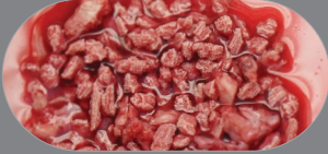
Granule form shown