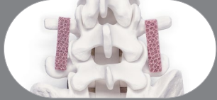
Block form shown